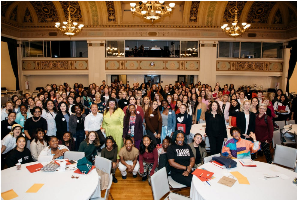
The Alliance for Girls' 6th annual conference, A Movement for Equity, was held on October 3rd, 2019, and was a day to remember! 500+ girls, gender-expansive youth, young women and girls' champions attended this memorable event.

About: The Alliance for Girls champions leaders who transform their communities. As the largest alliance of girls' organizations in the country, and the only hub of resources for those organizations in the Bay Area, the Alliance for Girls' proven expertise brings together hundreds of organizations and leaders under a shared vision through collaboration that generates systemic change. This coalition's work is all about enabling girls with the power to learn, to be seen, to be heard, to be understood and to make a difference. The Alliance for Girls is achieving that goal by creating an inspired movement of members, partners, services and resources. The result is an ecosystem of leadership provided by an exceptional network of adult allies, girls' organizations, schools and others dedicated to helping girls and young women reach their full potential in all facets of their lives.