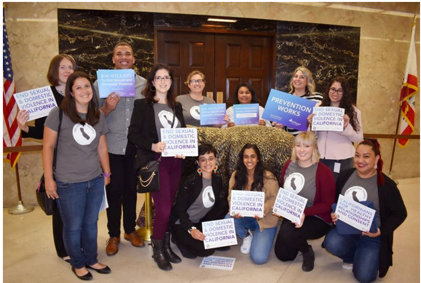
Team Members from CALCASA and the Partnership visited Governor Newsom's office to deliver sign-ons from 115 organizations and 1,344 individuals, urging our policymakers to support ongoing funding to prevent sexual and domestic violence.

CALCASA has a national and local perspective of emerging issues, and is familiar with the demographic and cultural makeup of California. CALCASA helps support the work of member centers by designing effective ways to address and integrate developing issues into the direct service and prevention programs of rape crisis centers, including providing training and technical assistance that many members may not otherwise be able to access.