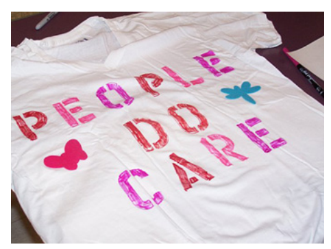
T-Shirt made by CAP clients and health center staff as part of Domestic Violence Awareness Month activities in October 2010

Despite the economic downturn, CAP is holding steady after 15 years and program leaders see compelling opportunities to continue to advance and expand this work. One current project, which is taking off slowly due to limited resources, but is ultimately core to the mission, is to research, compile, and evaluate information on screening and assessment protocols being used at health centers across the country. This would enable the family advocates to take this information back to their respective centers and use the material to reconvene stagnant or inactive task forces, engaging participants in concrete planning for refining standards and practices,