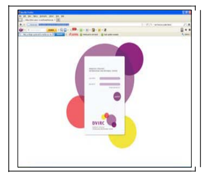
DVIRC login Page