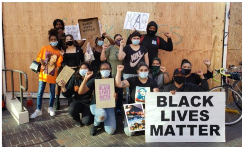
Organizers at a youth-led Black Lives Matter march in Oakland on June 1.